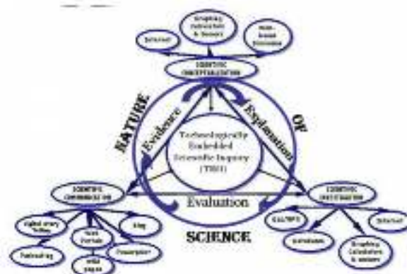
Figure 1. Schematic of TESI.

3.3.1 Technology Embedded Scientific Inquiry TESI is a learning model that uses technology in conducting scientific or investigative processes. TESI has three characteristics, as the schematic Ebenezer illustrates in the picture as follows: